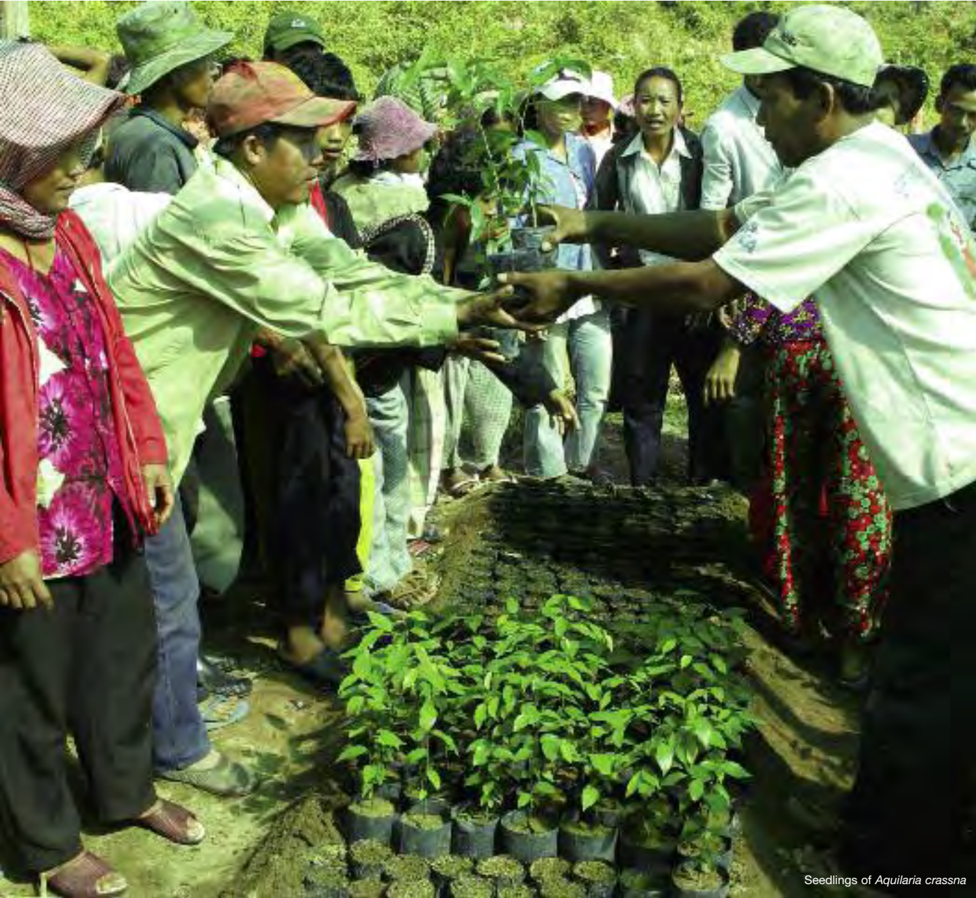
Seedlings of Aquilaria crassna

BGCI's medicinal plants programme links the conservation of medicinal plants with the livelihoods of rural communities.